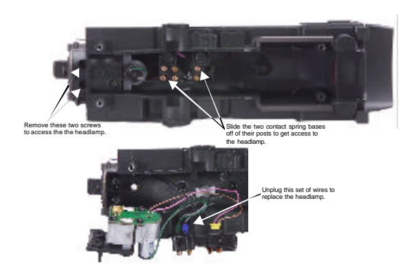
Figure 9. Replacing the Headlight

You can obtain replacement bulbs directly from the M.T.H. Parts Department.