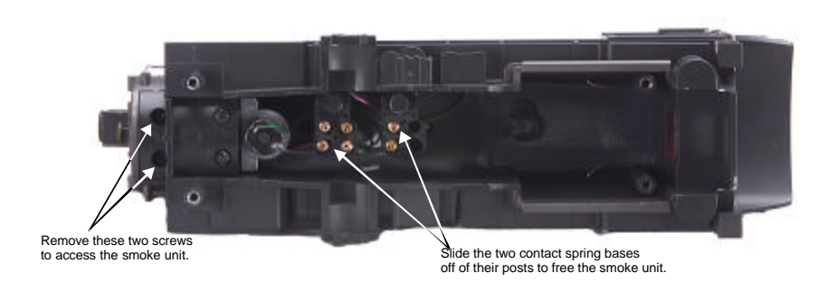
Figure 7. Removing the Smoke Unit Mouting Plate to Access the Smoke Unit

You can obtain replacement parts and wick replacement instructions from the M.T.H. Parts Department.