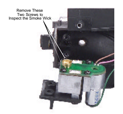
Figure 8. Inspecting the Smoke Unit's Wick