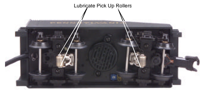
Figure 2. Lubrication Points on the Tender

You should regularly lubricate all side rods and linkage components and pickup rollers to prevent them from squeaking. Use light household oil and follow the lubrication points marked "L" in Figures 2 and 3. Do not over oil. Use only a drop or two on each pivot point.