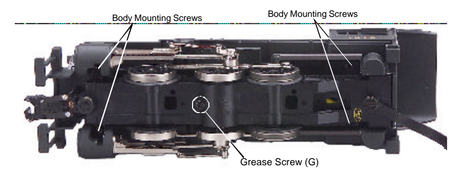
Figure 4. Greasing Points on the Engine and Body Mounting Screws