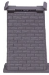
Piers A through J (x20)